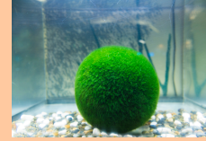
Marimo moss balls are green algae rolled into spheres