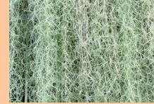
Spanish moss is a flowering plant (bromeliad)