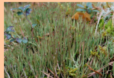
Clubmosses & Spike-mosses are vascular plants , closer to ferns