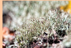
Reindeer moss, Oak moss, Iceland moss are all actually lichens