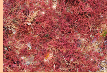
Irish moss / Sea moss is actually red algae